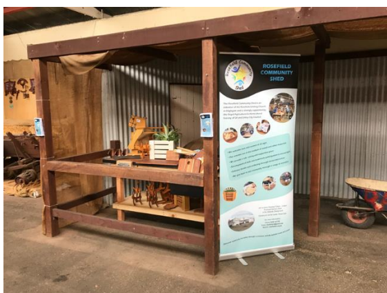
Our static display at this year's show

This year we were able to submit a static display in the Ram Shed during showtime. This had limited success as we did not have items for sale and the stand was not continuously manned due to the short notice we had received. It is hoped that we will be able to get a position in the Ram Shed in 2020 and it is planned to make items that we will be able to sell as well as promote the Shed in general.