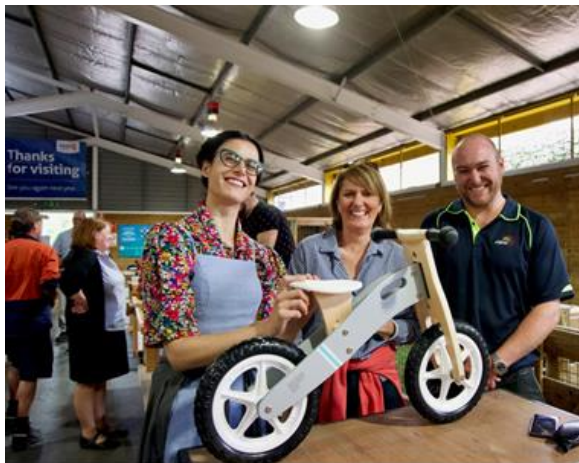
RAHS Teambuilding program