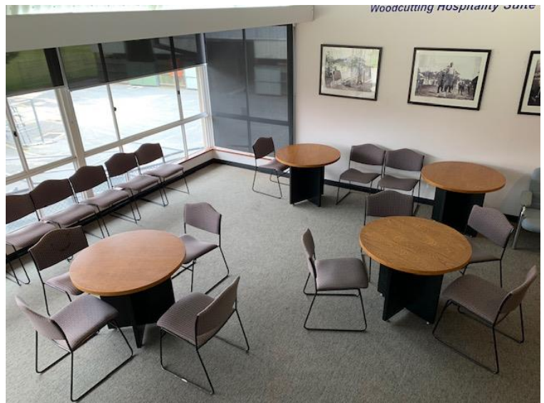
Renovating tables for the woodcutter's Suite (before and after)