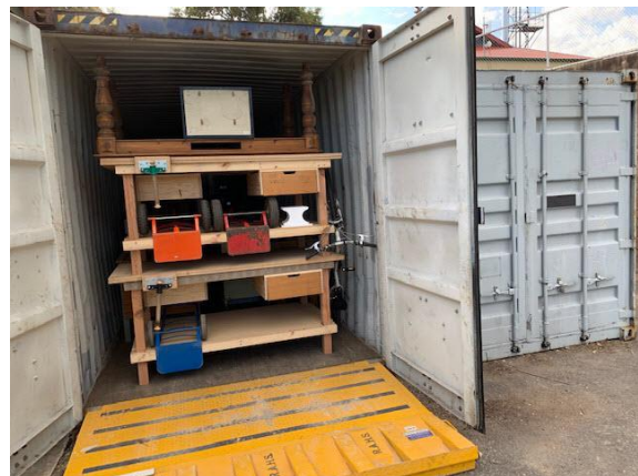
Last Container packed ready for show time

The Royal Adelaide Show has been the focus of our attention for most of this year. The end of this year's show marked the first anniversary of our residence in the Bank SA Pavilion at the Showground. It also confirmed our ability to be able to completely vacate our premises two weeks prior to the show and then reinstall and recommission all our equipment promptly and efficiently when the show was over. Our members are to be commended for their enthusiasm, teamwork and extra effort made to ensure that this task was achieved quickly, efficiently and without incident.