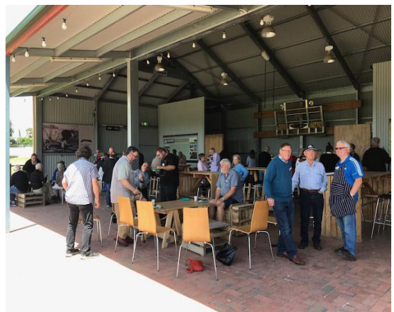
Christmas Lunch in the Bull Bar