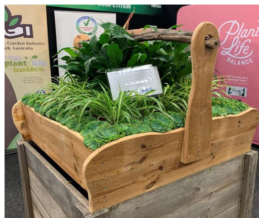
Winning entry in Small Gardens category

Once again, our show entry, in conjunction with Malvern Mitre 10 won first prize in the garden's in small spaces category.